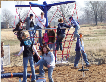
The Rotating Net (background) and Supernova (foreground) are two of the new items on the playground.

be enjoyed for years to come. Thanks, again, to everyone who helped out. Your efforts were not in vain!