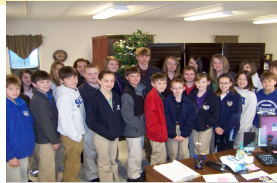
Beta Club 2008-2009