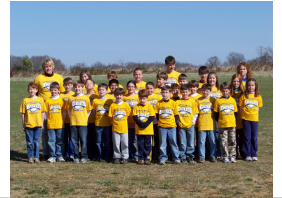
Beta Club 2008-2009

The Running Club will start up again on Monday, March 9th. Practices will be held on Monday and Thursday afternoons from 3:30—4:15 p.m. The next 5K run will be the Swampers Run which is scheduled for April 25th in Muscle Shoals, AL.