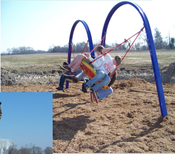
Students enjoy a sunny day...just a swingin'!

bolt A in slot B", as there was "some assembly required"! It was a group effort that resulted in a beautiful and unusual playground. Please know that the students are simply "dizzy" with appreciation! These new items will