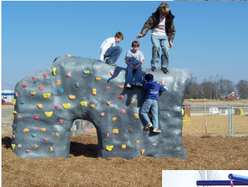
Students enjoying the great Climbing Wall