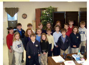
Spelling Bee Participants