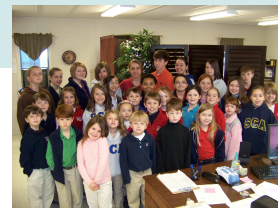
Art Festival Participants