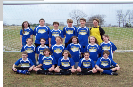
Beta Club 2008-2009